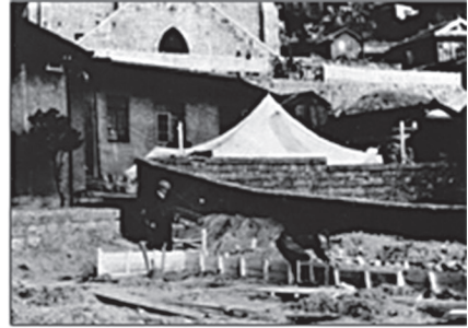
〈1952〉 일신부인병원이 개원 준비를 하고 있는 일신유치원