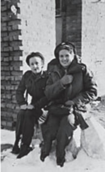
Figure 1. RAANC Nurses in Korea

began in April 1951, along with enlistment for the Women's Royal Australian Naval Service (WRANS). 8 Then, was there any involvement of Australian NGO people during the Korean War? If so, what was their background? Where were they? What was their concern, and how did they help the Korean people?